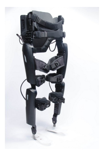
ReWalk Personal 6.0

Our experience working with health care practitioners and ReWalk users, including reports by study participants, as well as recently released clinical data suggest that ReWalk has the potential to provide secondary health benefits. These benefits include reducing pain and spasticity and improving bowel and urinary tract function, body and bone composition, metabolism and physical fitness, as well as reducing hospitalizations and dependence on medications. Because of these secondary medical benefits, we believe that ReWalk has the ability to reduce the lifetime healthcare costs of individuals with spinal cord injuries, making it economically attractive for individuals, healthcare providers such as hospitals and rehabilitation centers, and third-party payors.